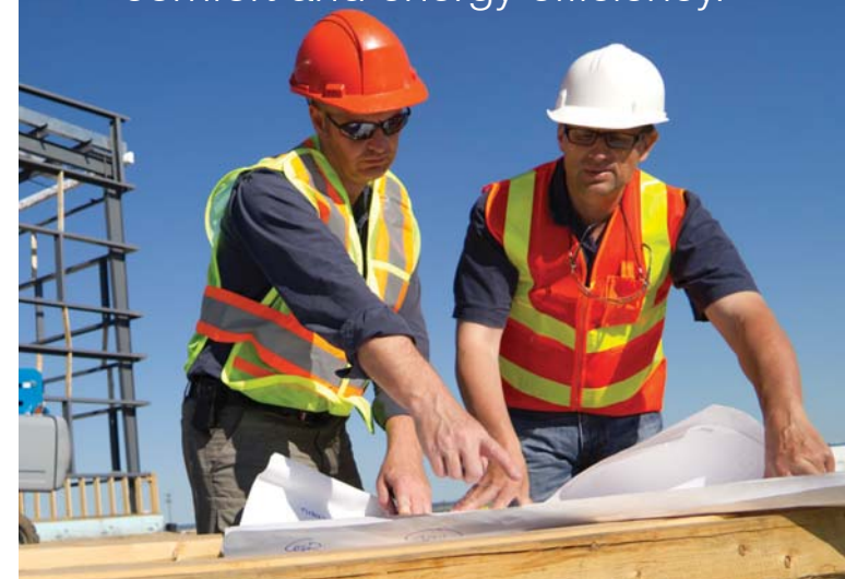
high performance reflective insulation

Building systems for thermal comfort and energy efficiency.